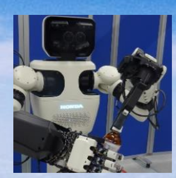
Honda Avatar robot

Making mobility in the skies more accessible for people