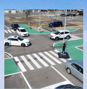
Honda Cooperative Intelligence